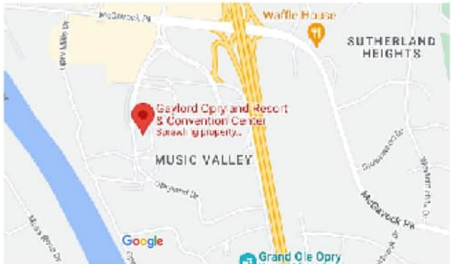
RMap data ©2022