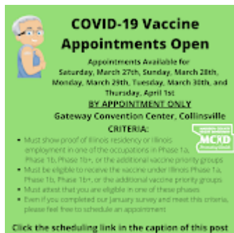
COVID-19 Vaccine Appointments Open - 3_27-4_1_2021.png 255K