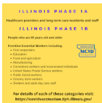
Illinois Phase 1a and 1b.png 176K