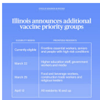
Governor's Open Phases 2021.jpg 100K