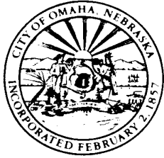
City of Omaha Jean Stothert, Mayor