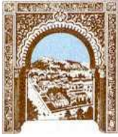
Gateway to the San Gabriel Valley