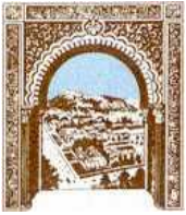
Gateway to the San Gabriel Valley