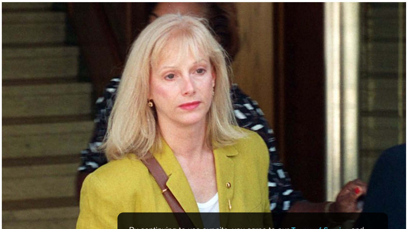
Sondra Locke leaves court in Burbank

By continuing to use our site, you agree to our Terms of Service and Privacy Policy . You can learn more about how we use cookies by reviewing our Privacy Policy . Close