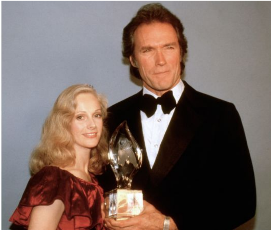
Clint Eastwood poses with Sondra Locke and his People's Choice Award for favorite motion picture actor in March 1981.

Locke also played singer Rosemary Clooney in a 1982 TV biopic, and directed the 1986 film "Ratboy," which flopped in the U.S. but was popular with critics in Europe.