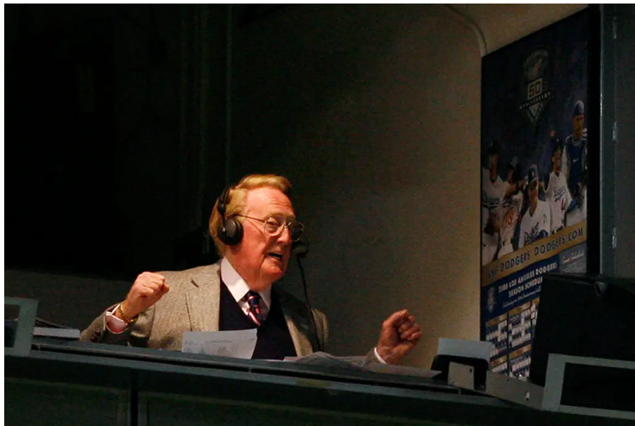
Mr. Scully at Dodger Stadium in 2008. He was elected to the broadcasters' wing of the Baseball Hall of Fame in 1982 and received an Emmy Award for lifetime achievement in 1995.