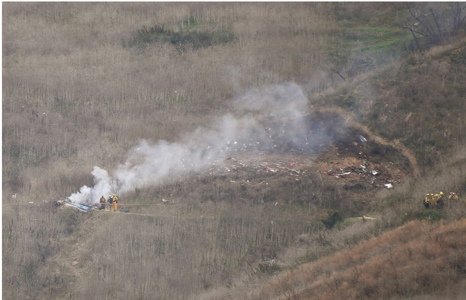
The crash site in Calabasas where Kobe Bryant and four others were killed on Sunday.