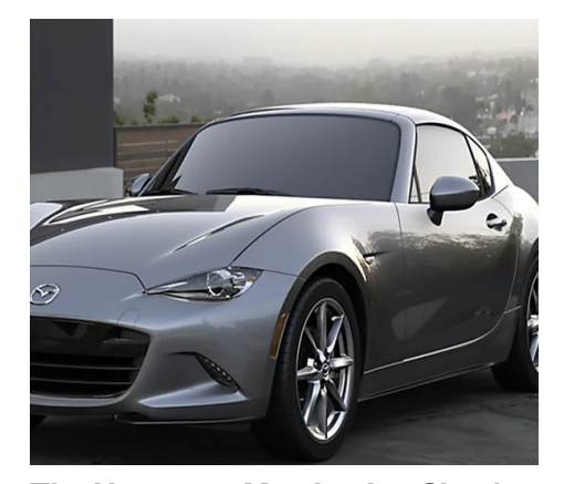
The New 2019 Mazdas Are Simply Astonishing!