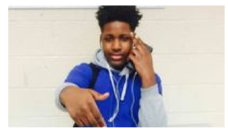
High school football player dies after passing out in weight room New York Post