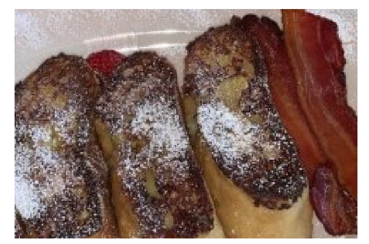
Why The Cheesecake Factory Is Struggling to Stay in Business Mashed.com