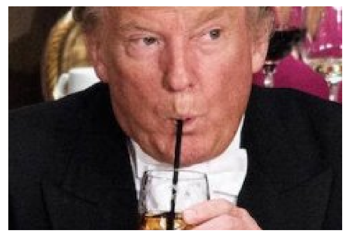
This is What President Trump Typically Eats in a Day Mashed.com