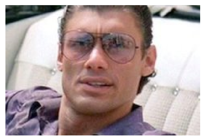
What Manny From 'Scarface' Looks Like After All These Years