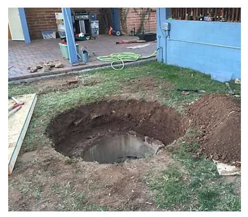
[Gallery] Man Buys New House. Then His Gut Tells Him To Dig In His Backyard