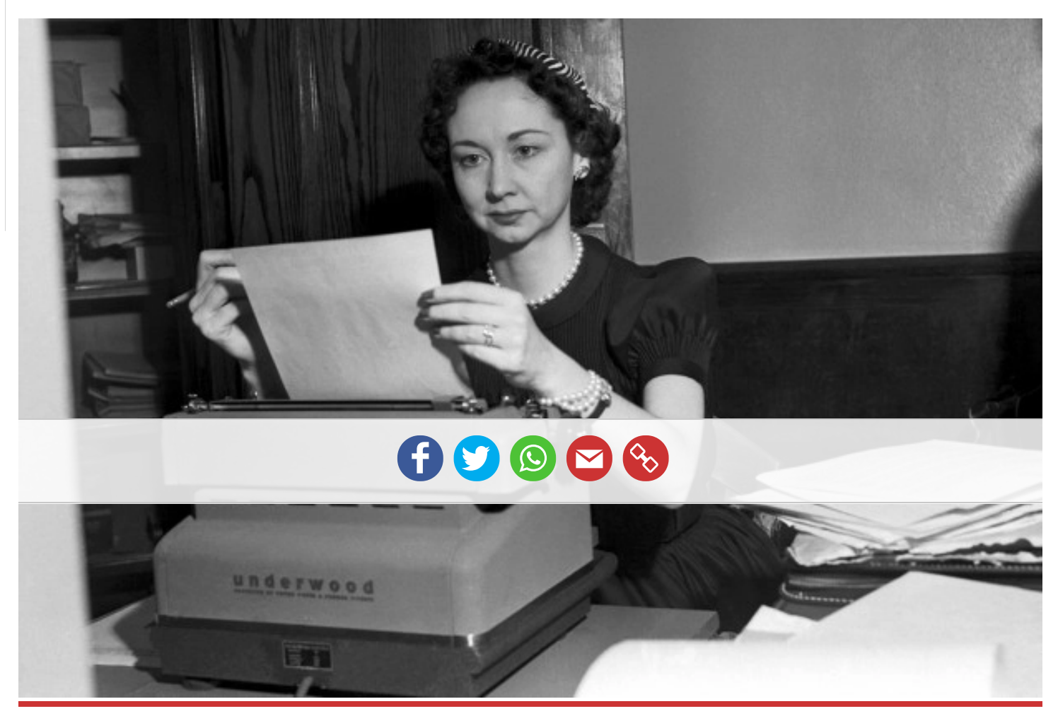
Dorothy Kilgallen