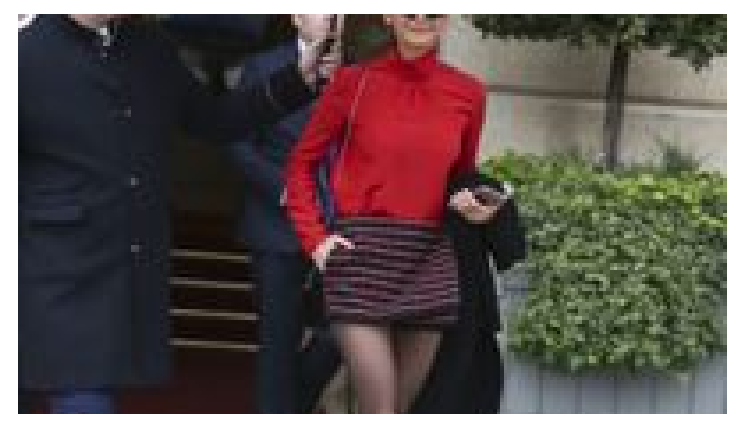
Mena Suvari gets a dramatic makeover and more star snaps Page Six