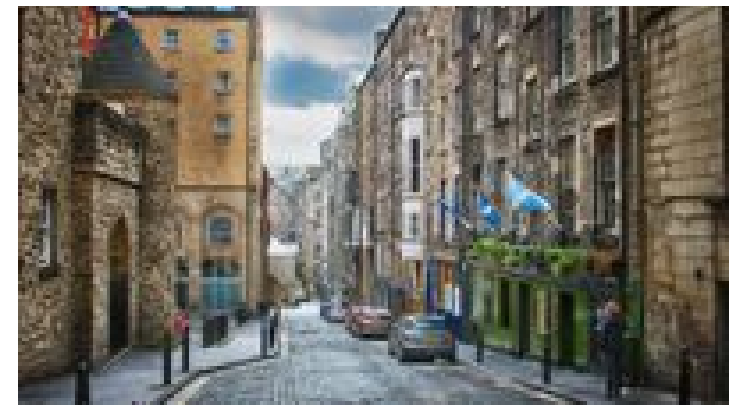
Mansion Global Daily: U.K. Prices Perform Well, Young Chinese...