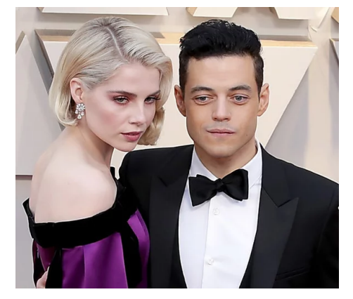
All The Oscars Couples That Made Us Swoon Livingly