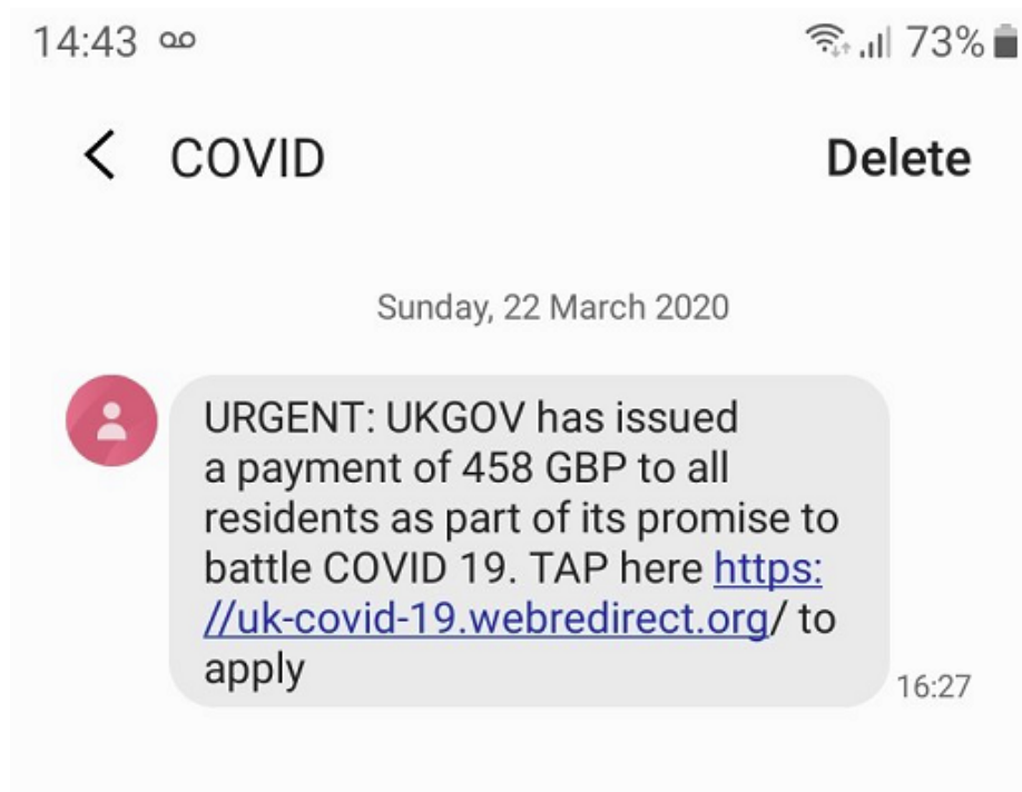
Figure 1: UK government-themed SMS phishing

Historically, SMS phishing has often used financial incentives—including government payments and rebates (such as a tax rebate)—as part of the lure. Coronavirus-related phishing continues this financial theme, particularly in light of the economic impact of the epidemic and governments' employment and financial support packages. For example, a series of SMS messages uses a UK government-themed lure to harvest email, address, name, and banking information. These SMS messages—purporting to be from “COVID” and “UKGOV” (see figure 1)—include a link directly to the phishing site (see figure 2).