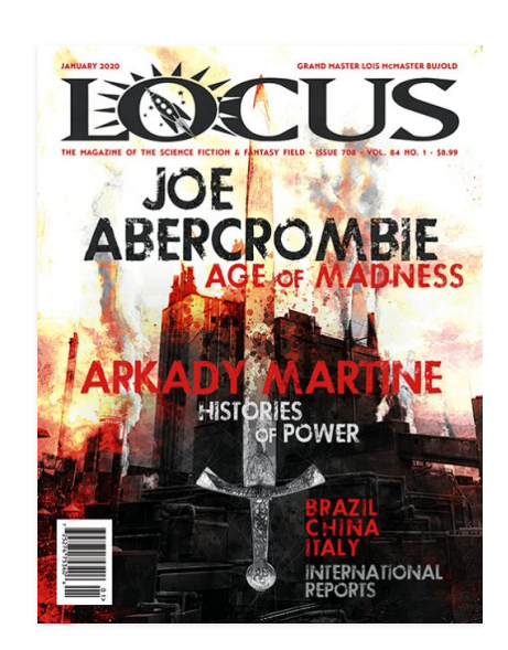
Buy Current Issue

Resnick began publishing with Edgar Rice Burroughs-inspired novella The Forgotten Sea of Mars (1965). He followed that with the Ganymede series: The Goddess of Ganymede (1967) and Pursuit on Ganymede (1968). After Redbeard (1969), he stepped away from SF for some time, instead writing pseudonymous erotica and Gothic novels (likely numbering in the hundreds) before returning to the field and his own byline in 1980 with tie-in Battlestar Galactica 5: Galactica Discovers Earth (1980, with Glen A. Larson).