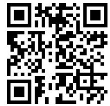
EXHIBIT A - City Official Twitter Accounts - retrieved from https://twitter.com/sfgov/lists/official-agencies/members as of Dec 19, 2019