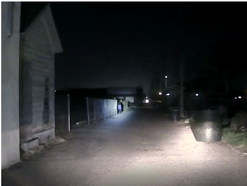
USE OF FORCE – OFFICER INVOLVED SHOOTING – 2103-2790