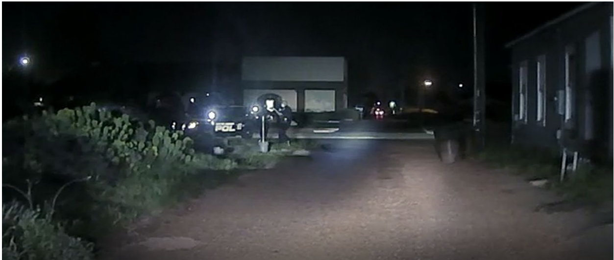
Corporal White and Officer Calderon can be seen backing up very quickly looking in a southwest direction.